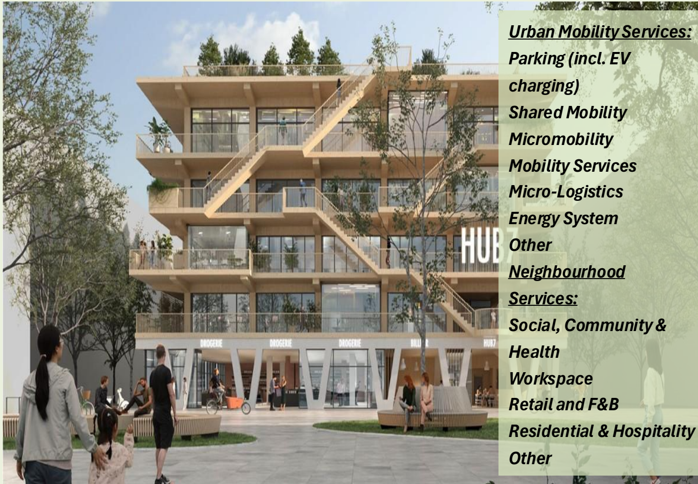
Digital rendering by KPW Papay Warncke Vagt Architekten Part GmbH